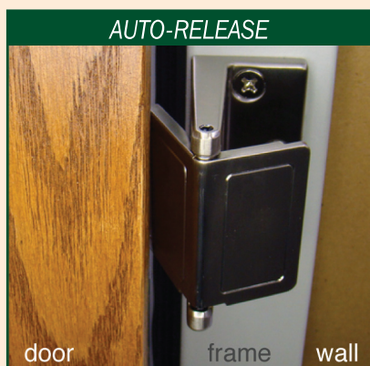
"Touch release"™ to disengage magnet. Also Disengages quietly upon door closing. Spring resets "SAL"

Eliminate the biggest "problem product" in the industry: