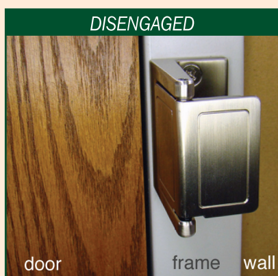
Spring holds "SAL" in unlocked position Push to engage and secure.

View animated demonstration online at http://dhsi-seal.com/securelatch.htm