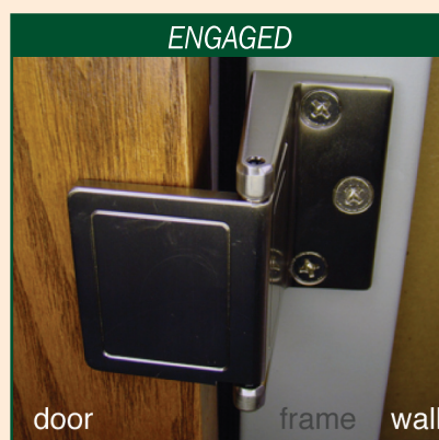
Magnet holds "SAL" in locked position. Prevents door from opening